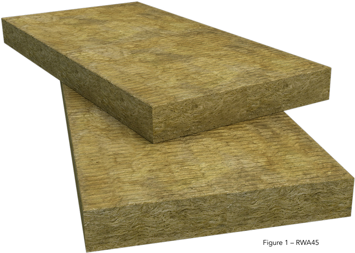
Figure 1 – RWA45